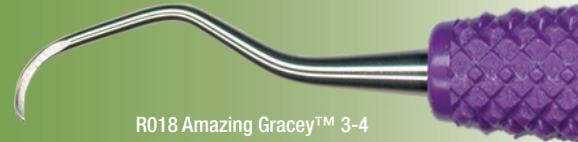
R018 Amazing Gracey™ 3-4