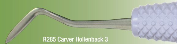
R285 Carver Hollenback 3