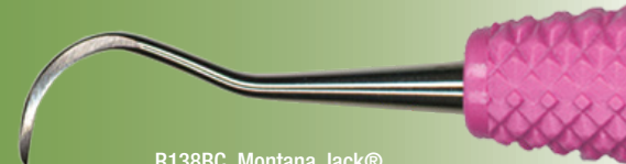
R138BC Montana Jack® Jack Goes Pink For The Cure

At PDT, we use high-quality USA 440A stainless steel to create harder and tougher instruments. Our attention to instrument blade size, angulation, curvature, and balance allow for superior anatomical adaptation leading to overall clinician comfort and efficiency.